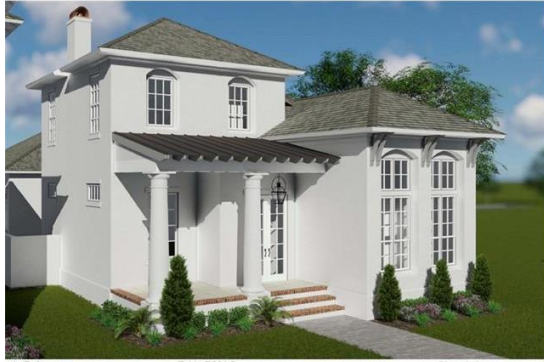
Code References Table R301.2 Sheet Index