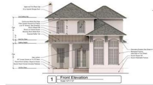
1 Front Elevation