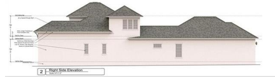
2 Right Side Elevation