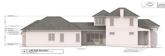
4 Left Side Elevation