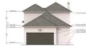
3 Rear Elevation